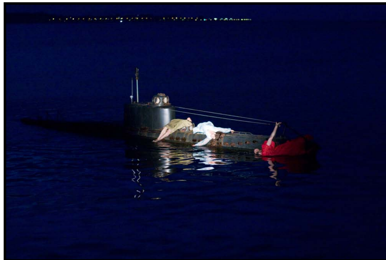
AQUARIUM and KRAKA (below)