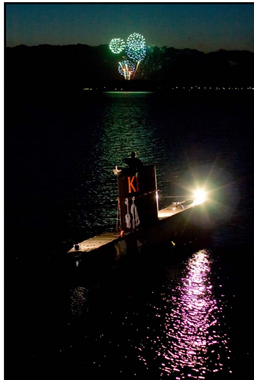
NAUTILUS